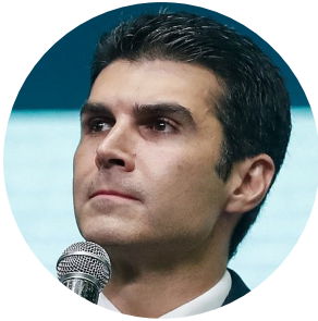
Hélder Barbalho State Governor of Pará

Hélder Barbalho was born in Belém on May 18, 1979. He was Minister of Fisheries and Aquaculture, Chief Minister of the National Secretariat of Ports and Minister of National Integration of Brazil. He holds a bachelor's degree in business administration from the University of the Amazon and a post-graduate degree with an Executive MBA in public management from Fundação Getúlio Vargas. In 2004, he was elected to the position of mayor of Ananindeua, having taken office at the age of 25, becoming the youngest mayor in the history of Pará. He was re-elected in 2008, then elected governor of the State of Pará in 2018.